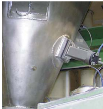
Cleaning bunker walls