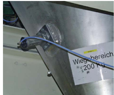
Cleaning weighing containers