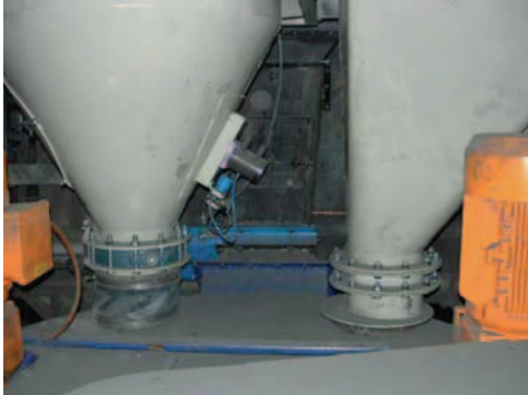
Loosening hard crusts with pneumatic linear vibrators