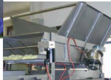
Conveying with stainless steel electric external vibrators