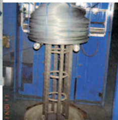
Easing, loosening wire coils with electric external vibrators