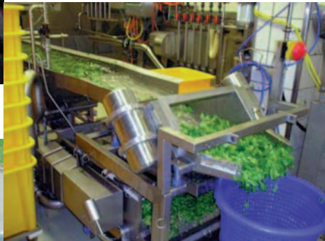
Conveyor sieving tray, driven by stainless steel electric external vibrators