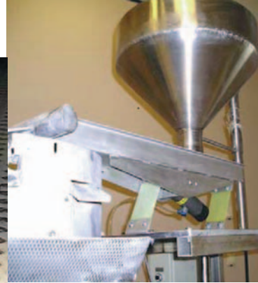
Gentle conveying and dosing of bulk materials with conveyor trays