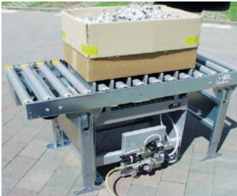
Compacting / levelling materials in a production line with a vibrating table