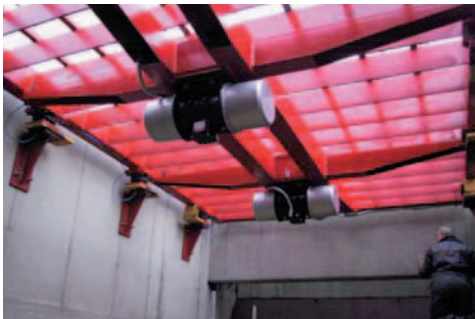
Sieving coarse bulk material with electric external vibrators