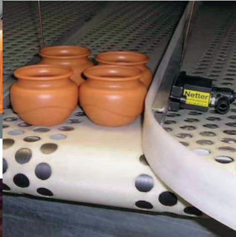
Loosening product compaction with pneumatic circular oscillators